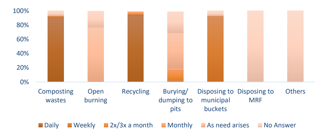
Figure 3. SWM strategies and practices among household respondents in Suyac Island, Sagay City, Negros Occidental, Philippines

Furthermore, the lack of Material Recovery Facilities (MRFs) in the island was a primary barrier to resident participation in waste recycling. Even in areas where MRFs were present, their design and functionality often did not meet the necessary standards, limiting their effectiveness (Camarillo & Bellotindos, 2021).